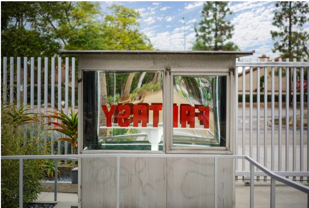
Image Credit: Research for the Bermuda Triangle [Regina Mamou + Lara Salmon]. Common Fantasy / Gemeinsame Fantasie , 2020–2021 [detail]. Courtesy of The Wende Museum of the Cold War, Los Angeles, California.

We must have your reservation and payment by March 1.